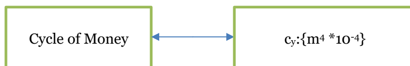
Figure 1: Cycle of money for c_y: \{m^4 * 10^{-4}\}

The next figure presents the paper's purpose for scrutiny: